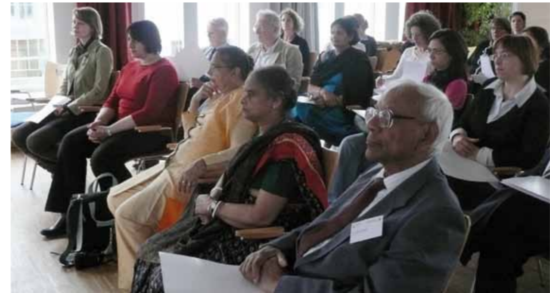
Participants of the AAMEE workshops in Hannover, 06.05.2008

The first evening aimed particularly at the introduction to the field of action of integration of migrant elders in Hannover and to the AWO Region Hannover e.V. in particular, as well as at a first encounter and informal exchange of experiences between the hosts, the representatives of the MGFFI and (international) guests.