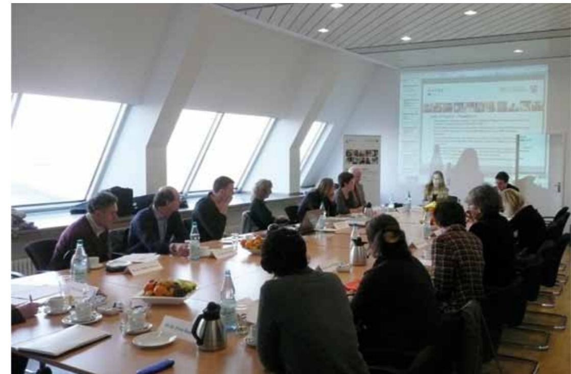
Constituent workshop of the European research network Active Ageing of Migrant Elders across Europe in the MGFFI on 5 February 2009

Constituent workshop of the European research network on February 2009 in Düsseldorf