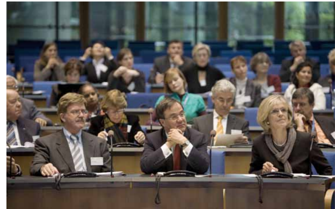
In the first front from left to right: Thomas Mann, member of the European Parliament and member of the committee for employment and social affairs; Armin Laschet, Minister for Intergenerational Affairs, Family, Women and Integration in the State of North Rhine-Westphalia; Bärbel Dieckmann, Lord Mayor of Bonn.