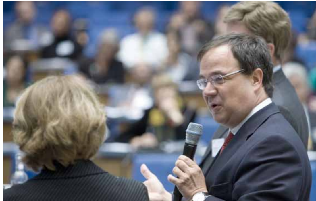
Armin Laschet, Minister for Intergenerational Affairs, Family, Women and Integration in the State of North Rhine-Westphalia.